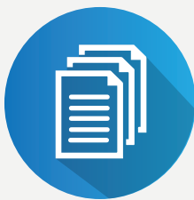
Multiple Jobs and Templates