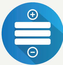
Customizable Fields and Workflow